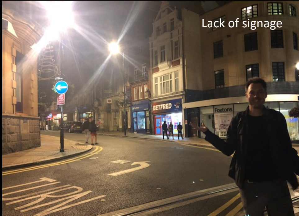
Lack of signage