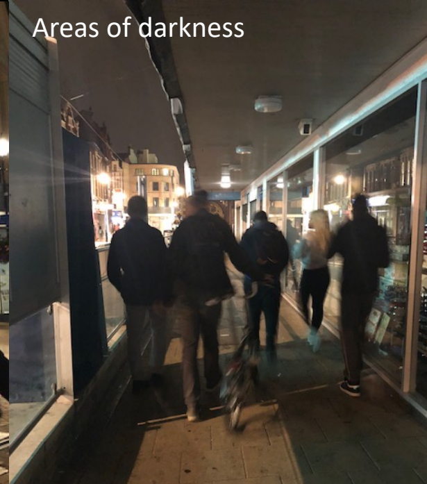
Areas of darkness