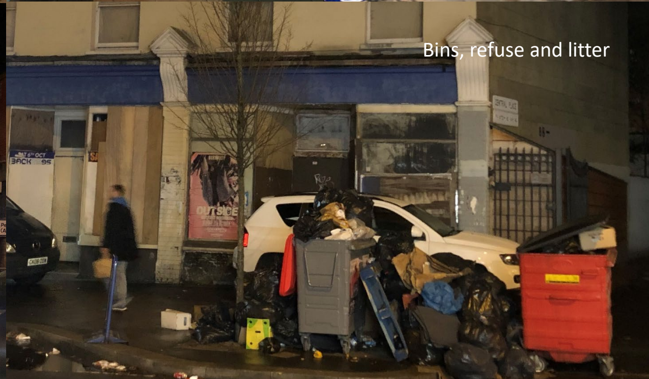
Bins, refuse and litter